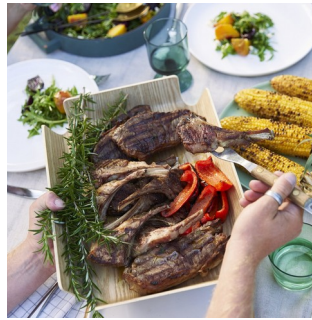
Australian lamb, grilled and ready to serve

With a well-established supply base, we connect you with a wide range of Australian producers to fulfil your requirements. Once a product is contracted, our dedicated shipping and documentation team works diligently to ensure every step of the process is completed quickly and efficiently.